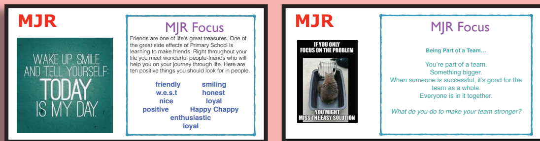
Sample pages from St Brigid's weekly newsletter