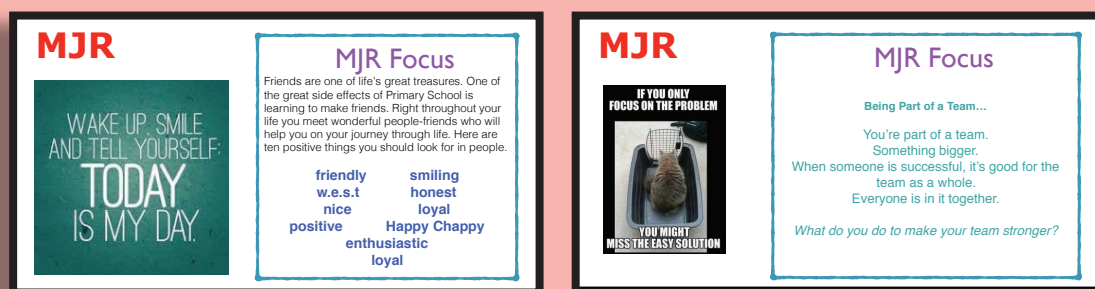
Sample pages from St Brigid's weekly newsletter