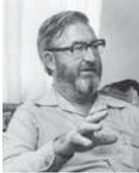
The author lecturing in 1979