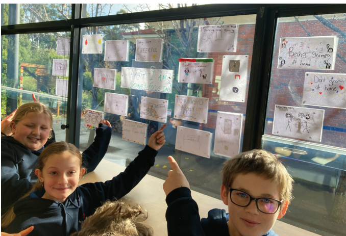
Students from Sacred Heart Geeveston, Tasmania standing in front of their habit.