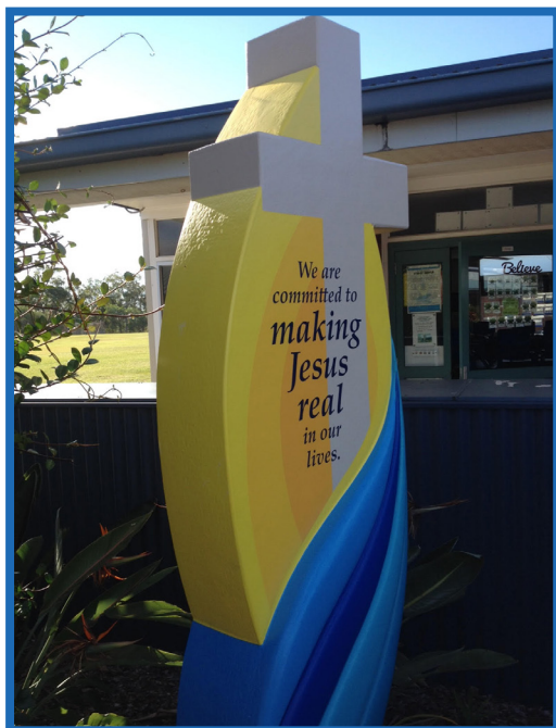
St John the Baptist Catholic Primary School Gladstone, Qld