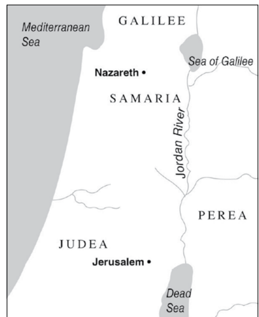
Nazareth in relation to Jerusalem.

says "He shall be called a Nazorean" (v. 23). Most likely Matthew sees a wordplay with nēšer , "shoot" or "branch," and intends an allusion to Isaiah 11:1, "A shoot shall sprout from the stump of Jesse." This reference to a Davidic royal heir once again highlights Jesus' identity as king in the line of David (see Rom 15:12;